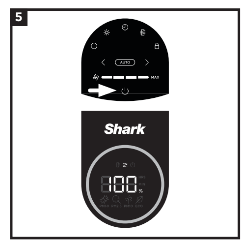
5. Plug the unit into an electrical outlet and press the power button on the top control panel.