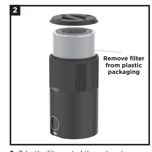
Take the filter out of the unit and remove packaging, then insert back into the unit. DO NOT run the air purifier unless the filter is removed from its packaging and properly reinstalled.