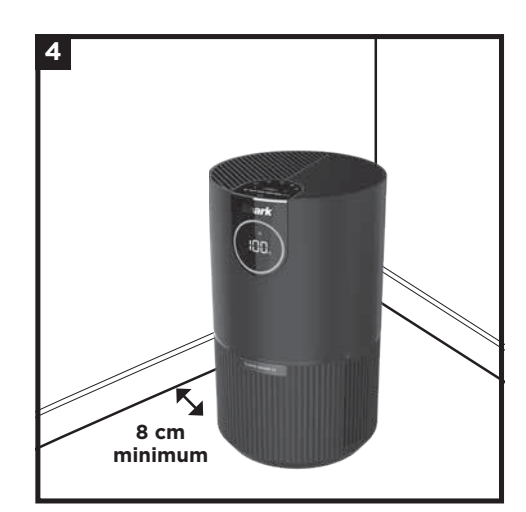
Set up the unit on a level floor surface, at least 8 cm away from walls and objects.