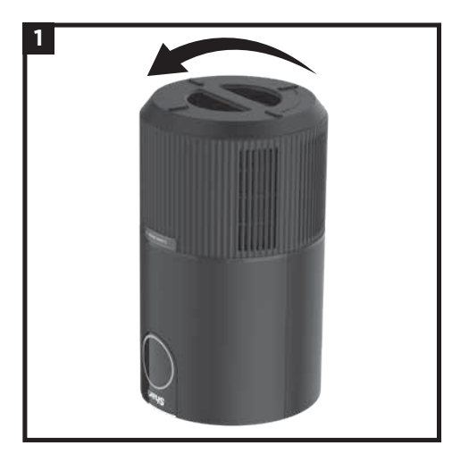
1. Remove the filter door located on the bottom of the air purifier.