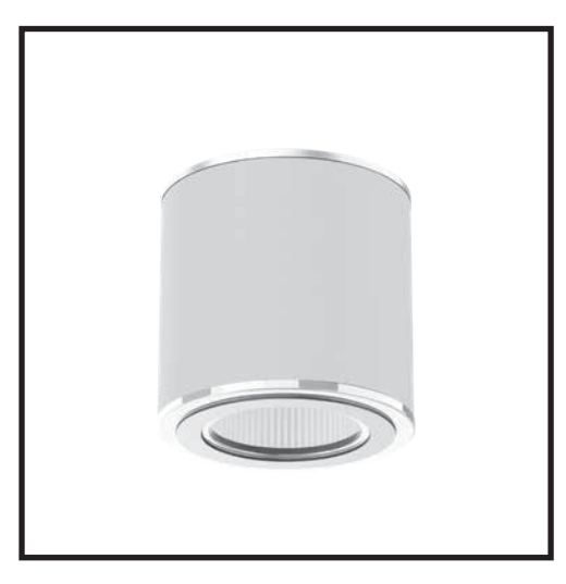
SHARK® NANOSEAL™ BASE FILTER WITH TRUE HEPA

Additional accessories and replacement filters are available on sharkclean.co.uk